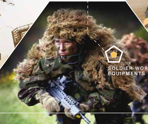
SOLDIER WORN EQUIPMENTS